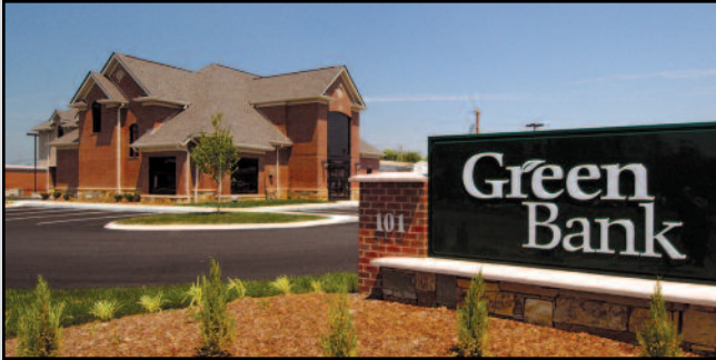
GREEN BANK Commercial (< $2 Million)