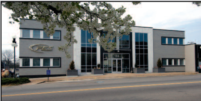
PULASKI ELECTRIC SYSTEM Renovation (< $2 Million)