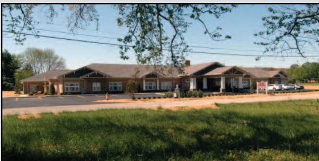
WEBB HOUSE Healthcare (< $2 Million)