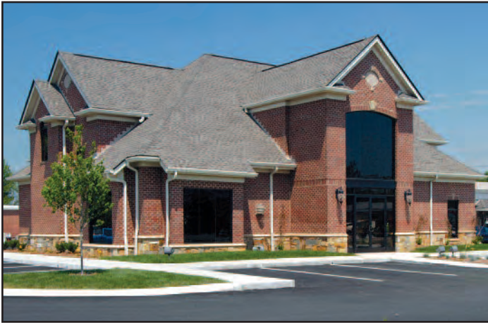
GreenBank

Experience, Dedication, Integrity Our Cornerstone for the past 50 years and the future.